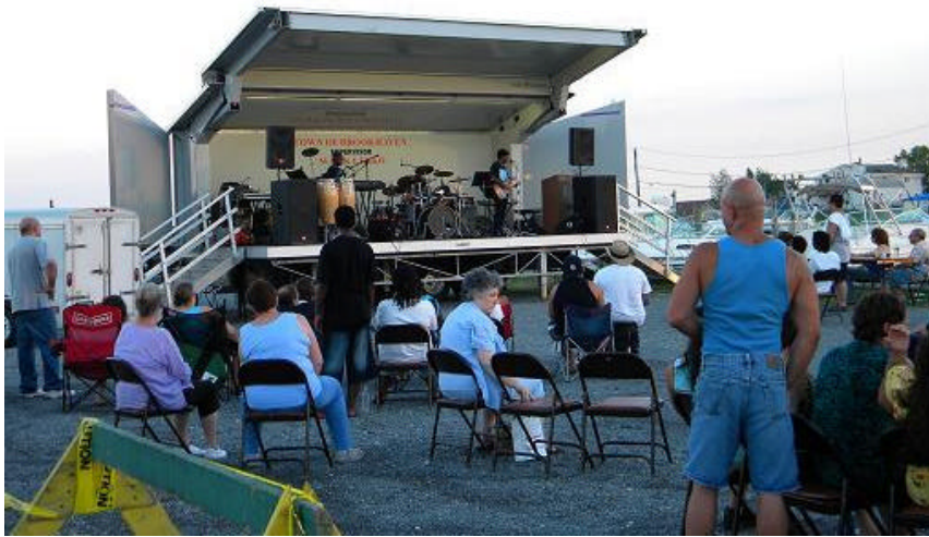
Music By The Bay