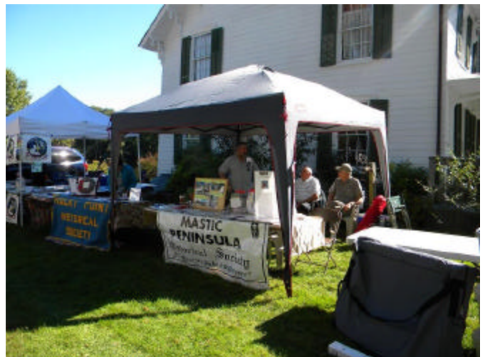
MPHS members at the Logwood Fair