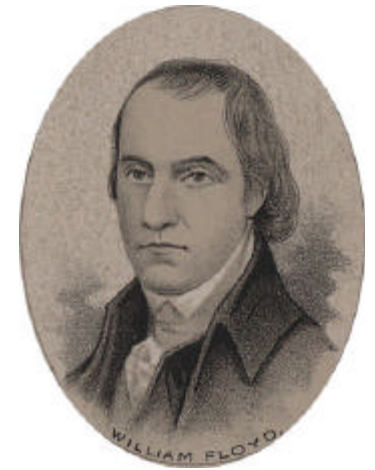
Signer of the Declaration of Independence