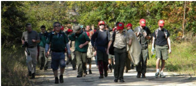
October 16, 2011 - MPHS members distributed our maps of ‘Historic Sites of the Tri-Hamlet Area’ during the Boy Scouts’ march of the Historic Tallmadge Trail.