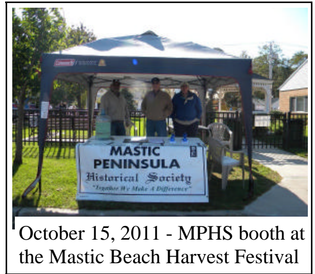
October 15, 2011 - MPHS booth at the Mastic Beach Harvest Festival

As members of the Mastic Peninsula Historical Society, we take pride in fulfilling our duties to observe, record and educate. Sometimes events unfold so quickly that, in the short term, we need to prioritize one duty over another. The past two months have been just such a time, and the need to document events as they occur has led to this quarter’s installment of our newsletter being sent out later than usual.