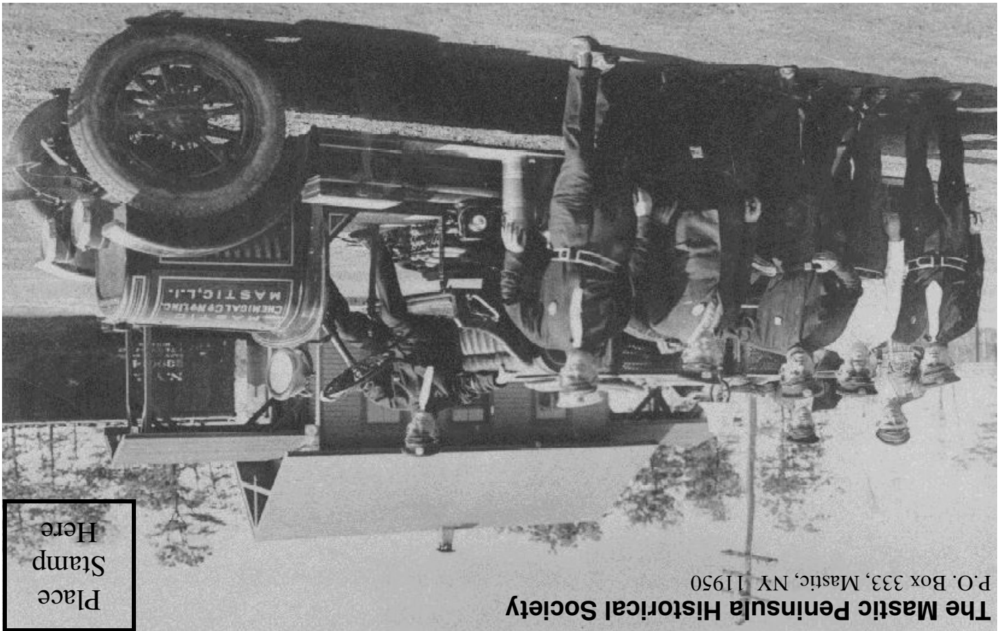
The Mastic Peninsula Historical Society P.O. Box 333, Mastic, NY 11950