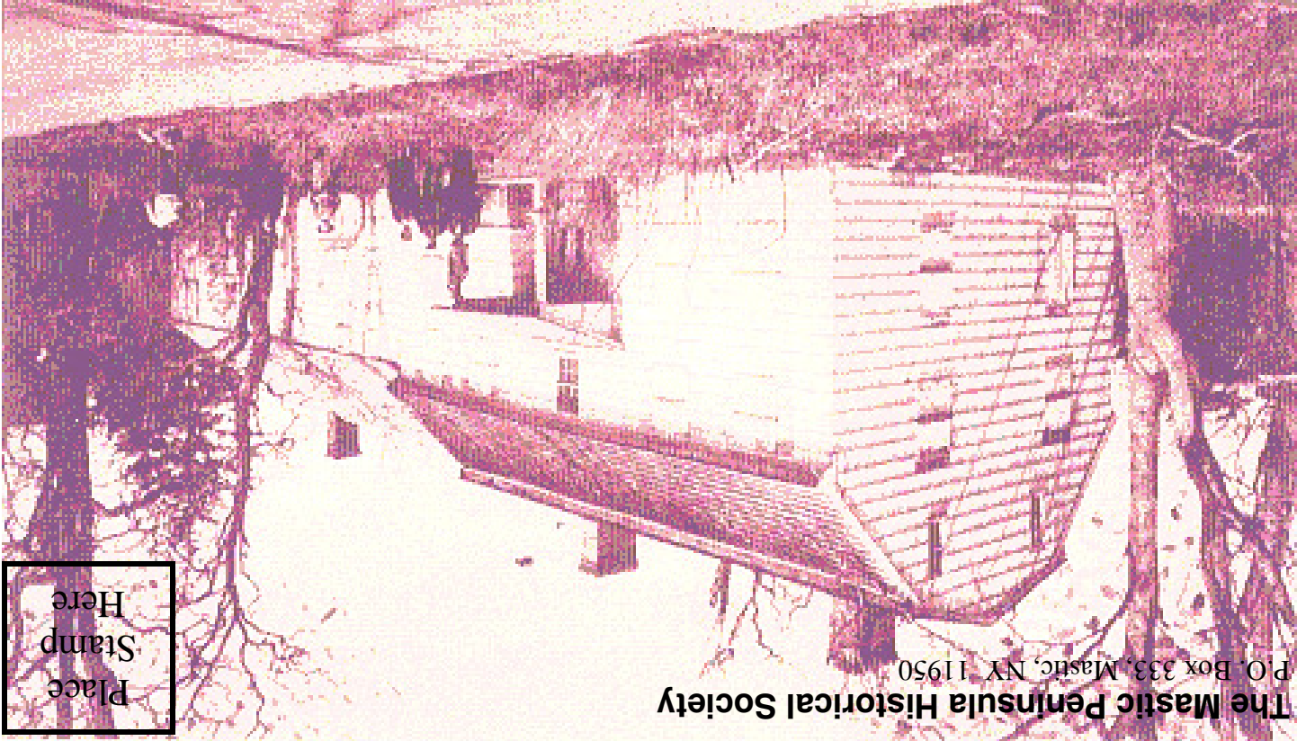
The Mastic Peninsula Historical Society P.O. Box 333, Mastic, NY 11950