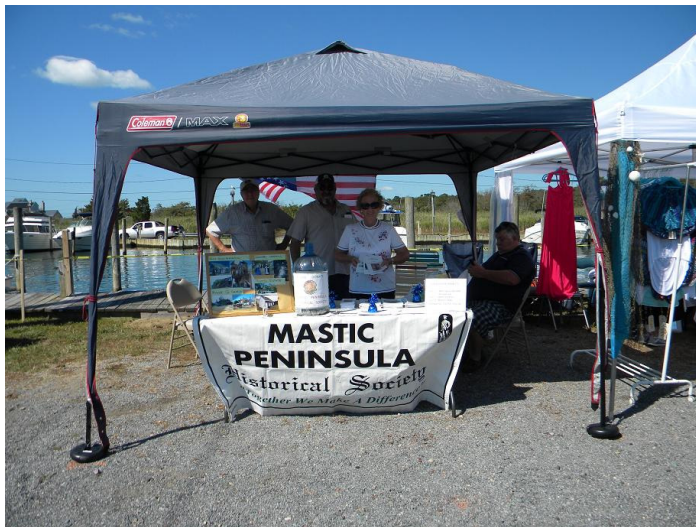
MPHS members sold booklets and gave away maps of local Historic Sites at the MBPOA Crab Festival on August 24.