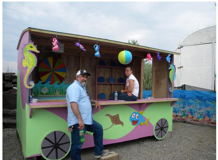
MPHS volunteers working a game booth at the Cultural Arts Guild’s Nautical Seafest on July 26.