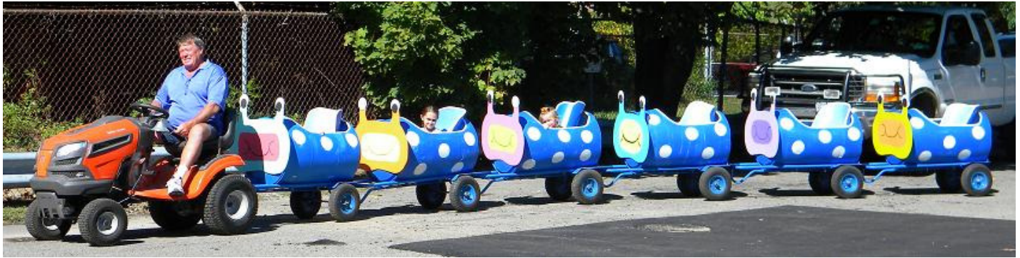
MPHS had a booth at the Pattersquash Creek Civic Association’s Annual Harvest Festival on September 27.