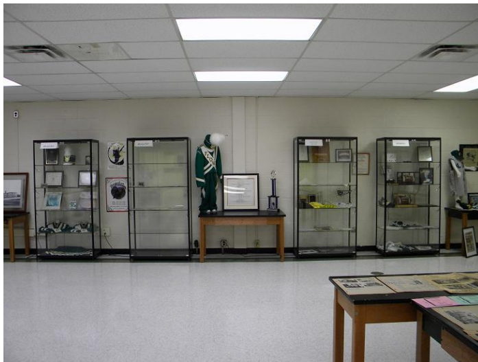
A view of some of the artifacts on display at the newly dedicated museum.